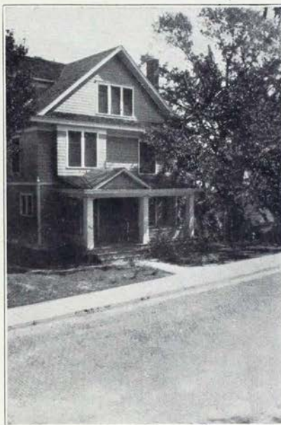
Iota Chapter House

In activities, Iota has a number of men who have gained high honors. The two highest non-athletic honors in the University are held by