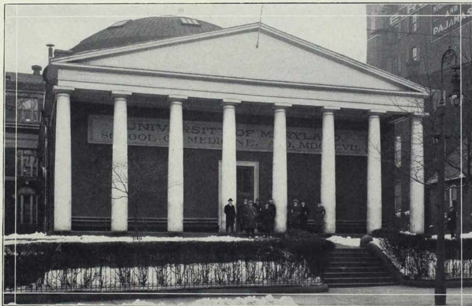
The Medical Building, the first building of the University of Maryland, was erected soon after its organization in 1807. In this building, General LaFayette had conferred upon him the honorary degree of Doctor of Laws.