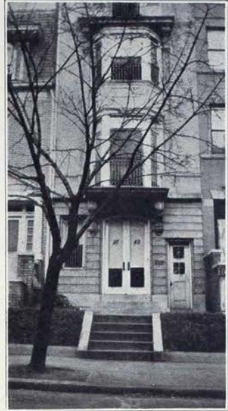
Mu Chapter House

The new Chapter House at 1843 Kalorama Road has excellently served its purpose, but we again find that we could use more space and are considering making a change in the near future. Numerous brothers from other chapters have paid us visits during the past few months, staying all the way from five minutes to five days. Mu Chapter always has plenty of room for