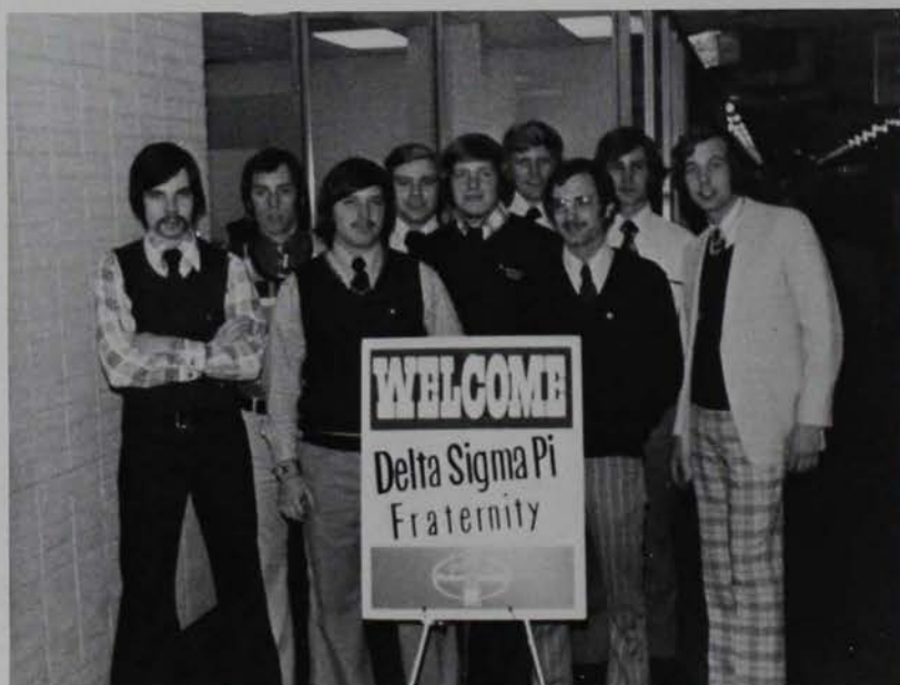
THE PROFESSIONAL SPOTLIGHT is focused on Beta Pi Chapter at Kent State University during the chapter's tour through the Wiring Division of Pachard Electric Company in Warren, Ohio.