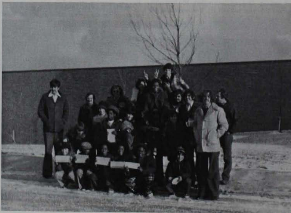
MEMBERS OF BETA PI CHAPTER at Kent State University recently hosted a group of underprivileged sixth grade boys at one of the Kent State "Golden Flashes" basketball games.

The Beta Xi Chapter is again working hard to keep the Business School Newsletter going. It's a great way to spread our name on campus, especially since we've segmented our market with it - it's only distributed to business majors. It's one way that keeps the Beta Xi Chapter thriving at Rider!