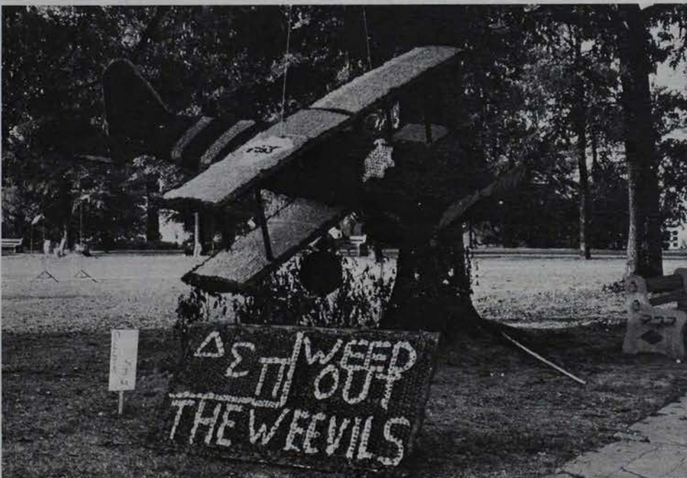
"WEED OUT THE WEEVILS" was the theme of this award winning homecoming display of Zeta Iota Chapter at Mississippi College. This was the chapter's third consecutive winning entry. The reference is to the Boll Weevils of the University of Arkansas at Monticello.