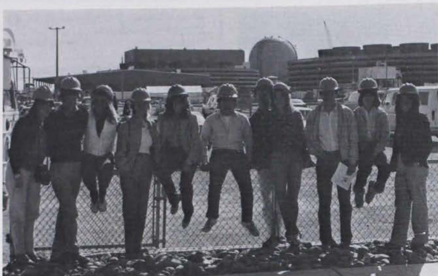
Members of Gamma Omega Chapter at Arizona State tour the Palo Verde Nuclear Power Plant in Phoenix, Arizona.