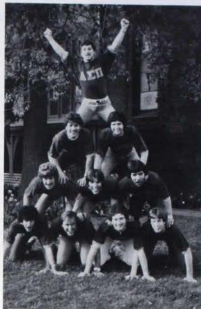
The newest Brothers of Epsilon Theta Chapter at Chico State get together to express their enthusiasm after their recent initiation.

The Eta Chi Chapter at Cal Poly-Pomona welcomed the 1983 year with our largest undergraduate membership since 1975. In the last two quarters, a total of 17 new Brothers have joined us and we are looking forward to much more growth throughout the rest of this school year. Also, we are looking toward the definite possibility of earning