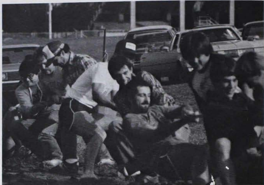
Ten of Iota Nu Chapter's strongest pull in Delta Sigma Pi's First Annual Cerebral Palsy Benefit Tug-of-War Tournament at Northeast Missouri State University. All proceeds were presented to Cerebral Palsy on their annual telethon in January.

Alpha Beta Chapter is looking forward to several major events this semester. We plan to invite several individuals from the University of Missouri-St. Louis campus where they are hoping to reactivate the Delta Sigma Pi chapter there. We will have a meeting between our Executive Board and their officers followed by a party to