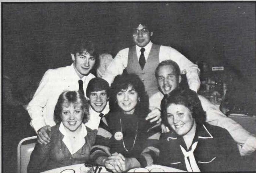
Members of Psi and Gamma Pi Chapters enjoyed themselves at the Great Lakes Regional Conference luncheon.