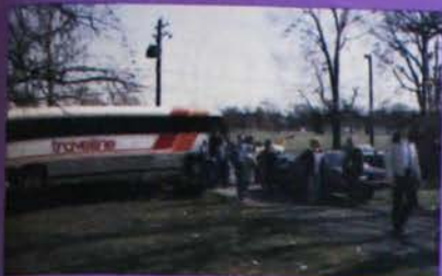
Three busloads of anniversary participants gathered in Oxford for The Central Office Tour.