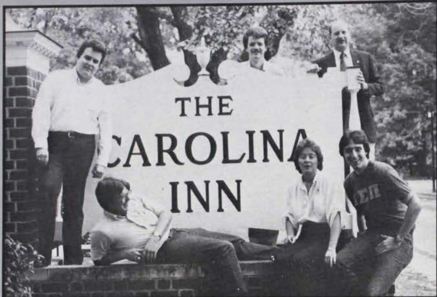
The weather, fraternalism and the hospitality of The Carolina Inn helped to make the South Central Regional Conference in Chapel Hill a success.