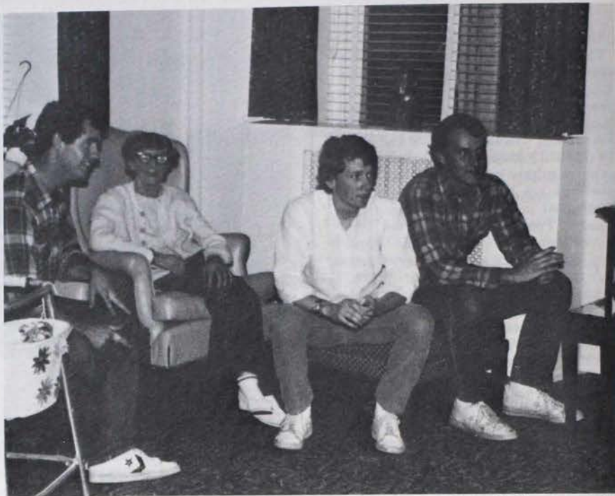
As one of their community service projects, the Brothers of Zeta Pi Chapter at St. Joseph's visited the Regina Nursing Home in West Philadelphia.