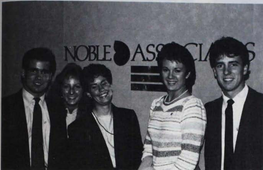
The Brothers of Kappa Omicron Chapter at Southwest Missouri State University recently toured Noble Associates, the largest advertising agency in Springfield, Missouri.