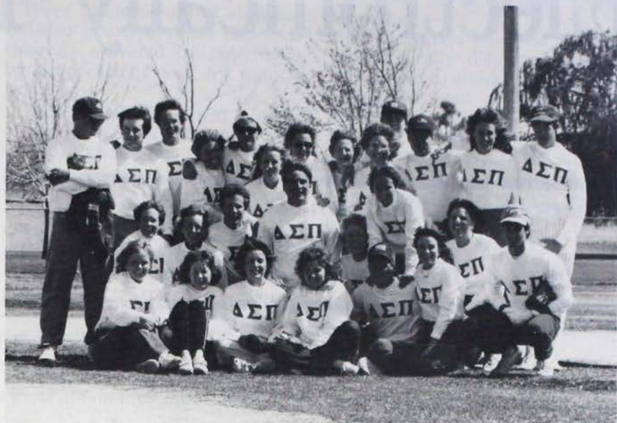
Beta Upsilon Chapter's pledges celebrated after the Pledge/Brother Softball Game at Texas Tech University.

IOTA PSI—Iota Psi Chapter is a small, but very effective chapter. The fall semester's highlights included fund raisers that single-handedly financed our community service projects that were extremely re-