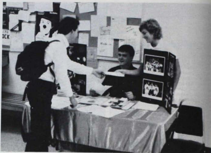
Alpha Delta Chapter at the University of Nebraska at Lincoln has been successful in its recruiting efforts during the past several years through the use of the information table.

THETA TAU —Theta Tau Chapter's 14th Annual Spring Break Trip to Daytona, Florida, (run exclusively by Theta Tau Chapter), was another successful experience.