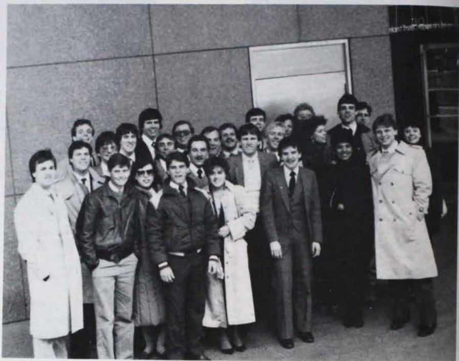
Members of Delta Chapter at Marquette University and Theta Xi Chapter at the University of Wisconsin at Whitewater visited the Board of Trade earlier this year while on a joint tour in Chicago, Illinois.

EPSILON OMEGA —The Brothers of Epsilon Omega Chapter were fortunate enough to attend two undergraduate days