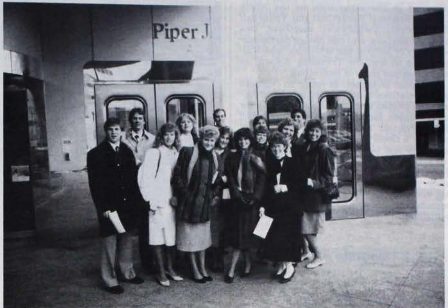
The Piper Jaffray Tower in Minneapolis was one of several tours conducted this year by Epsilon Chapter at the University of Iowa.

To celebrate the holiday season the Brothers sponsored a Christmas Party for the entire business faculty giving us a chance to meet them in a social atmosphere. We felt that the party was necessary