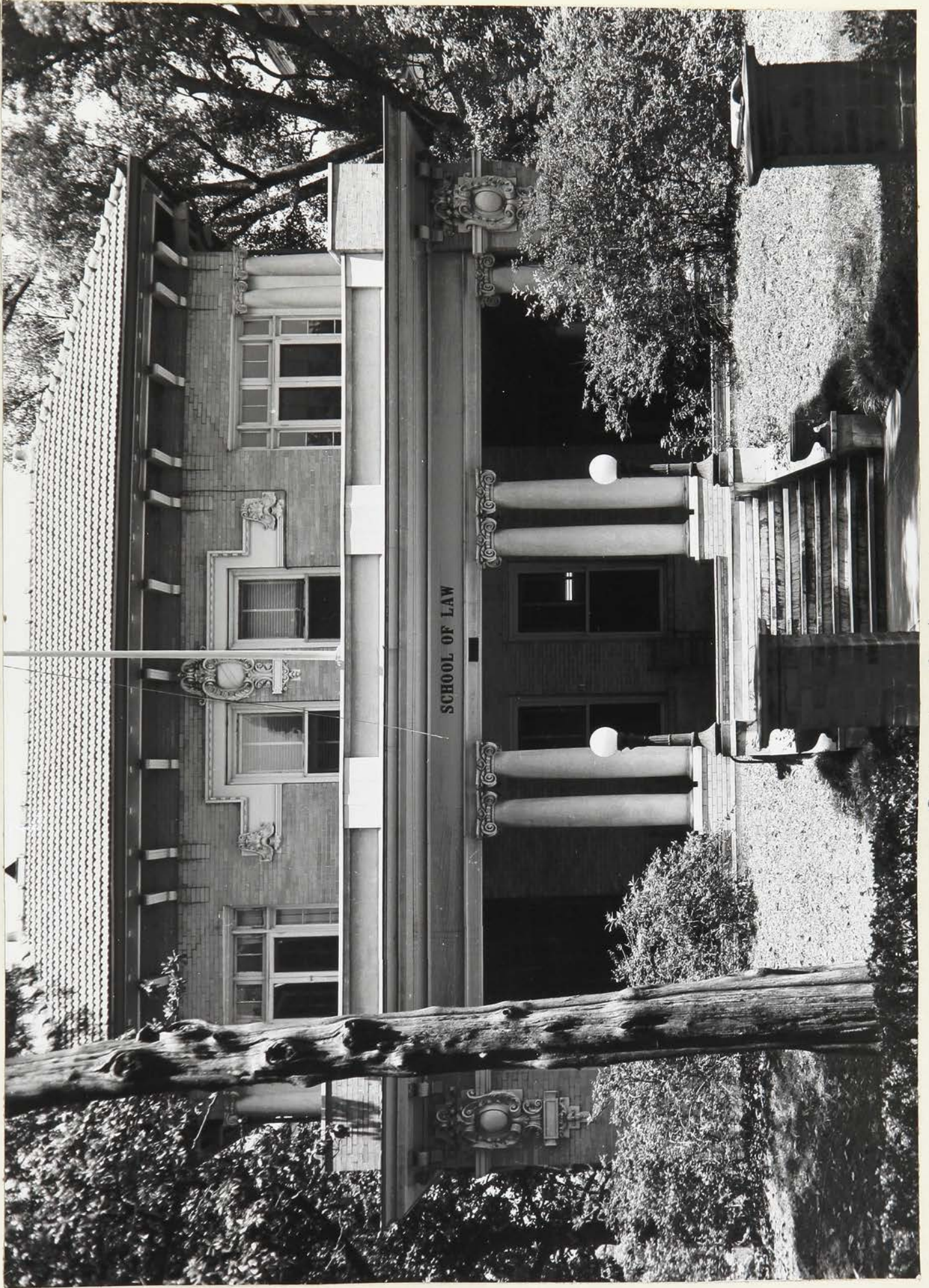
School of Law